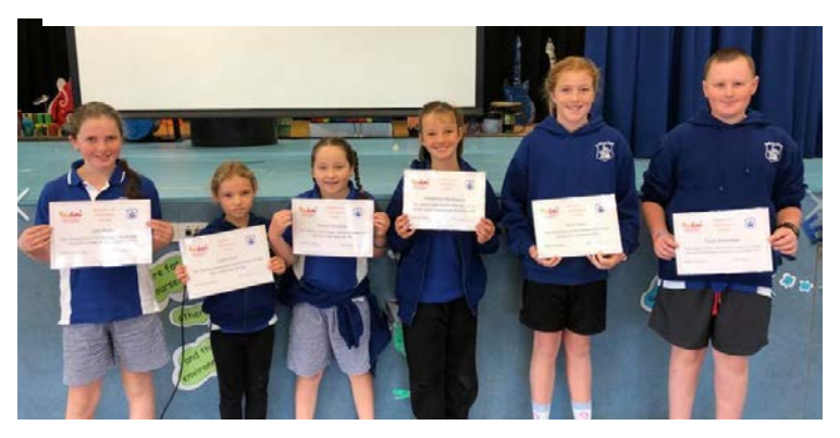
Acts of kindness awardees