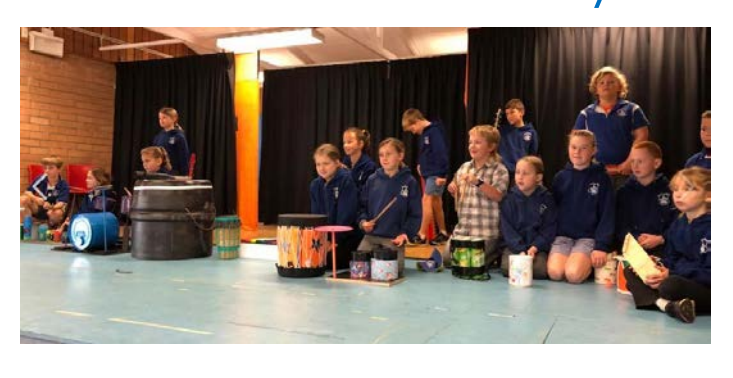
Handmade music instruments