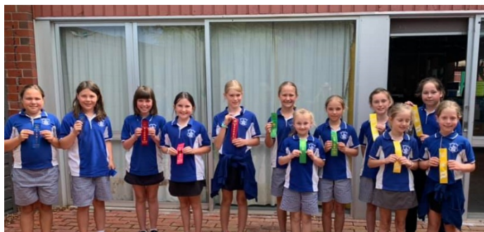
Junior girl relay

Congratulations to everyone who participated in the School Athletics! Well done to everyone!