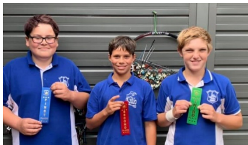
Senior shot put