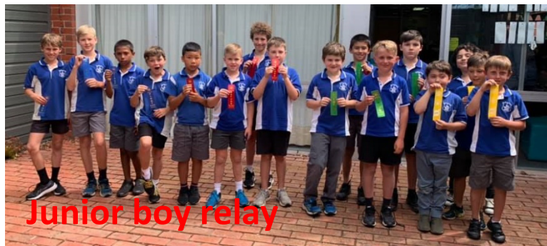
Junior boy relay