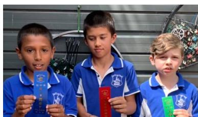
8yr boy 100m