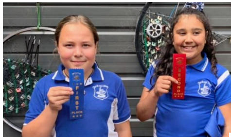
Junior girls discus