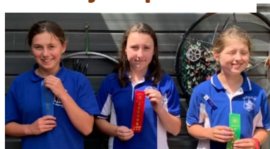
Senior girl high jump