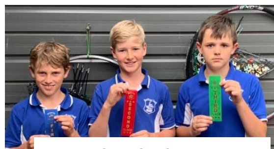
Junior boy high jump