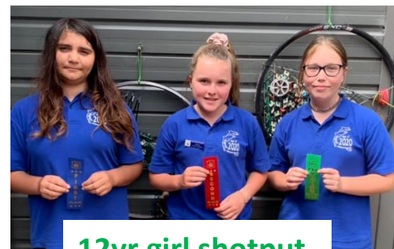
12yr girl shotput