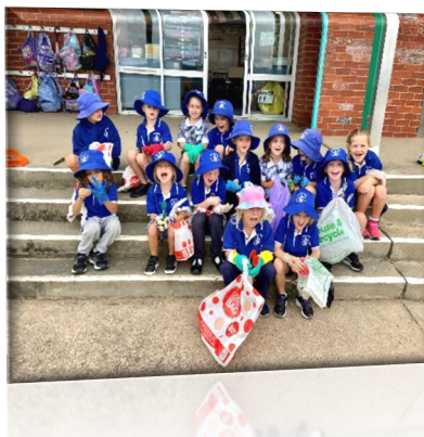
Photo Day Thursday 16 th March

Envelopes can be returned to the office on or before the photo day. Sibling envelopes collect at office.