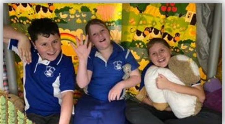
Creating shelters in the classroom