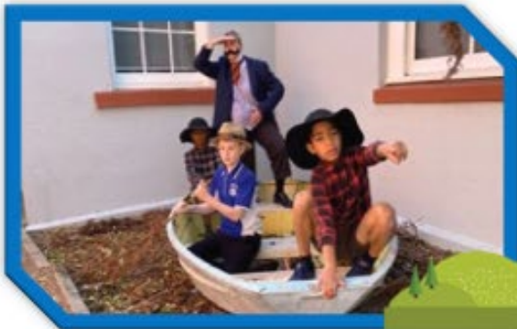
Looking for land - Education Week