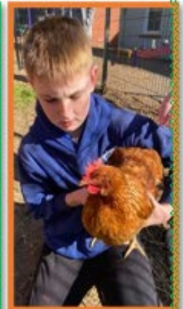
Looking after our school chickens