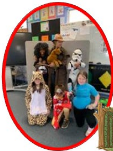
Dressing up - Book Week